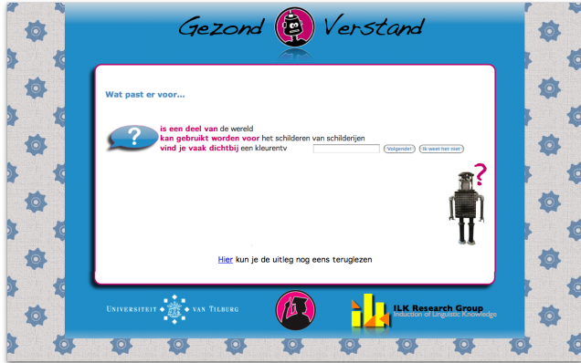
Figure 1: Second phase of the game: guessing a concept based on assertions provided

in the first experiment. The experiment was carried out in a real-world setting, using questionnaires on paper instead of online, as we wanted to avoid look-ups and parental help. Note that our online GWAP does include the second game, which the player automatically enters after having played the first game. Figure 1 provides a screenshot of this second phase of the online GWAP.